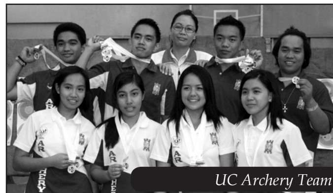
UC Archery Team