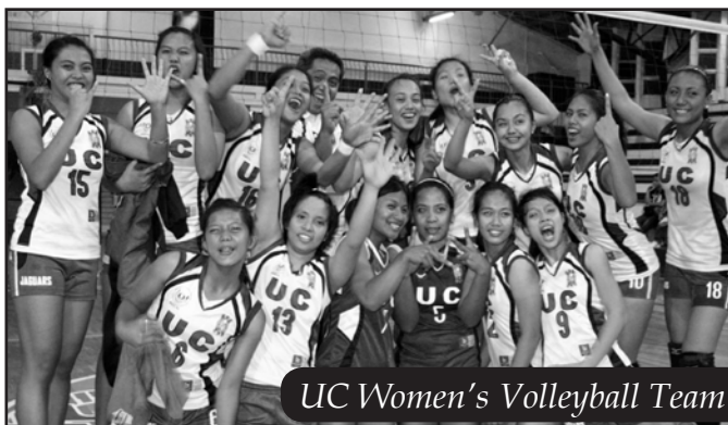
UC Women's Volleyball Team