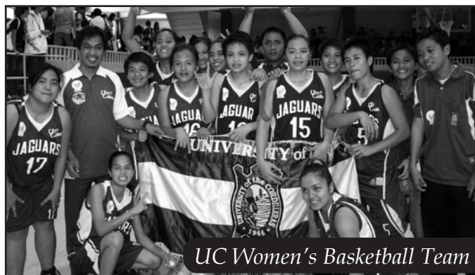
UC Women's Basketball Team